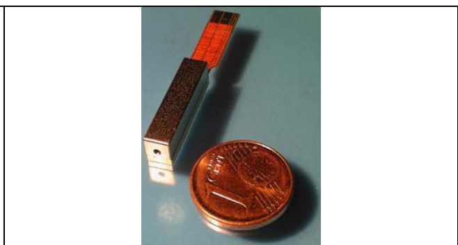
Fig. 2: single color green laser prototype

We designed and built small form factor laser module prototypes (see fig. 1) consisting of a red diode laser and a green frequency doubled laser suitable to illuminate microdisplays. This module can be easily extended to include blue lasers as well. For mobile applications such laser units need to exhibit efficiencies between 10% and 20% from electrical power consumption to optical output power due to limited battery capacity.